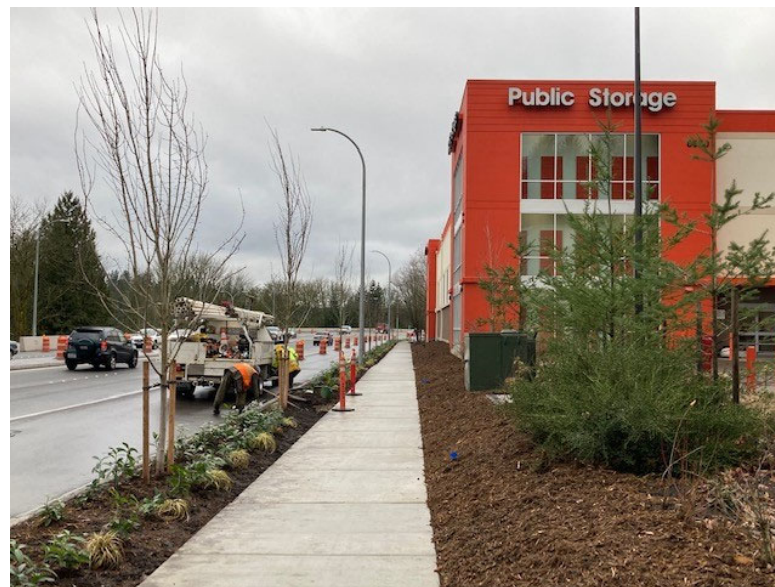
North side of SR 522 between 91st Ave NE and 83rd PI NE (Looking West)