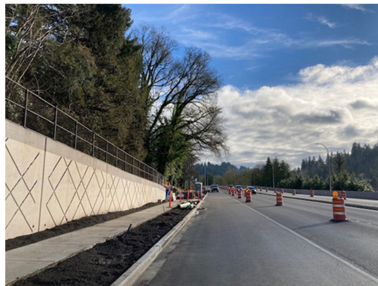
North side of the SR 522, just east of 83 rd PI NE (Looking East)