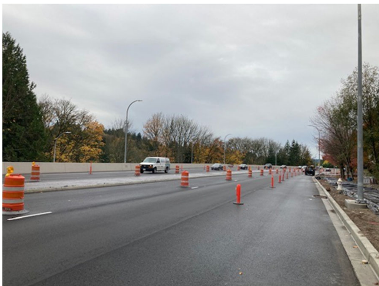
SR 522 between 96th Ave NE and 83rd PI NE (Looking West)