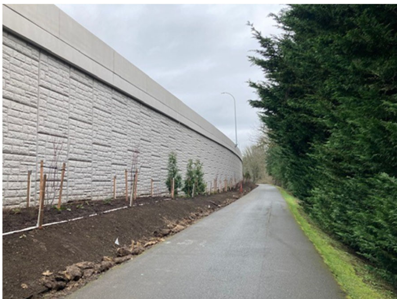
South side of the SR 522, Burke-Gilman Trail just east of 83rd PI NE (Looking East)